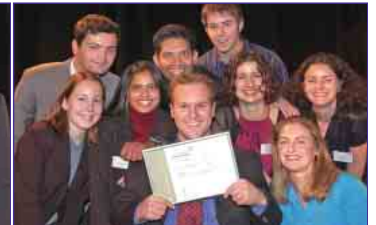
ABOVE: The 2004 winners.